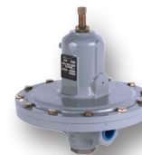
95 & 98 Regulators