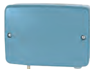
44B Series Blind Pneumatic Transmitter