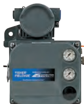
DVC6000/6200 FIELDVUE® (Remanufactured)