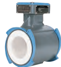
8000A Magnetic Flowtube