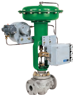
Sliding Stem Valves