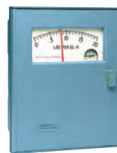
43AP Pneumatic Indicating Controller