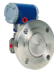
IDP10/PSFLT Flush Diaphragm