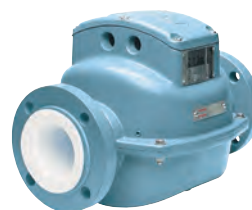
2800 Magnetic Flowmeter