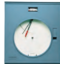
40P Recording or Indicating Pneumatic Controller