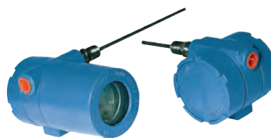
444 Alphaline® Field Mounted Transmitter