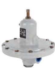
95 & 98 Series