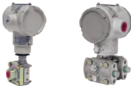
STA, STD & STG Transmitters