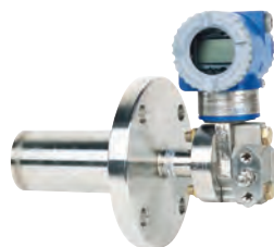
IDP10/PSFLT Extended Diaphragm