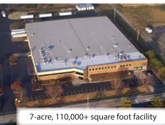
7-acre, 110,000+ square foot facility